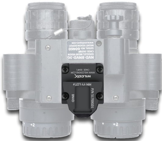
(SHOWN: BNVD SHOE)